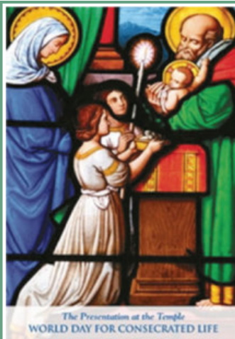
The Presentation at the Temple WORLD DAY FOR CONSECRATED LIFE